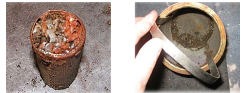
Figure 1: Davis Dam cooling water in-line strainer before and after Hydro-Optic™ UV (right) in 2013

Davis Dam is a hydroelectric facility with a nameplate capacity of approximately 250 megawatts that is managed by the Bureau of Reclamation (Reclamation) Lower Colorado Dam Office. Following the spread of quagga mussels to Lake Mead, Reclamation began a feasibility study in 2007 to identify control options that could protect their facilities (Hoover, Davis, and Parker Dams) while having little to no environmental or ecological impact. This location was chosen as the research facility to evaluate the Hydro-Optic™ (HOD) UV treatment system versus traditional medium pressure UV. Following the evaluation of various chemical and non-chemical control methodologies, the Hydro-Optic™ (HOD) UV treatment system was selected as the preferred treatment to supplement operational and mechanical activities already in place at Davis Dam.